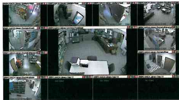
These are some of the views that our new system can monitor.